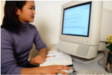
Computer Systems Analyst

Fill in the blank beside each occupation with the correct major listed in the middle of the page.