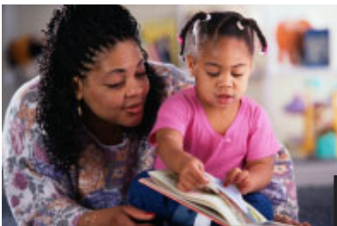
Licensed Professional Counselor