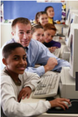
Elementary School Teacher