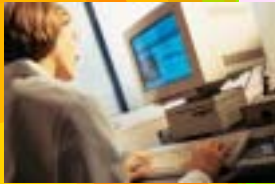
3. Graphic Designer