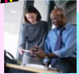
7. Government caseworker