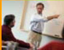
2. Adult Education Teacher