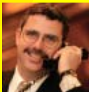
5. Financial Manager