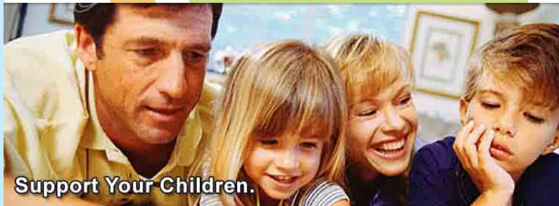
Support Your Children.

Help children understand how school subjects relate to careers: